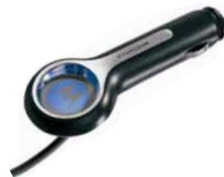
Micro USB Rapid Rate Vehicle Power Charger 31-0987-01-MT MSRP $29.99