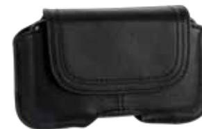
Black Faux Leather Pouch 34-2343-01-XE MSRP $19.99