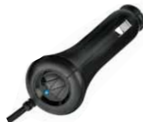
Micro USB Mid Rate Vehicle Power Charger 31-1011-01-MT MSRP $19.99