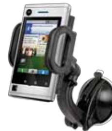
Windshield / Dashboard Car Mount 60-1941-01-XE MSRP $24.99