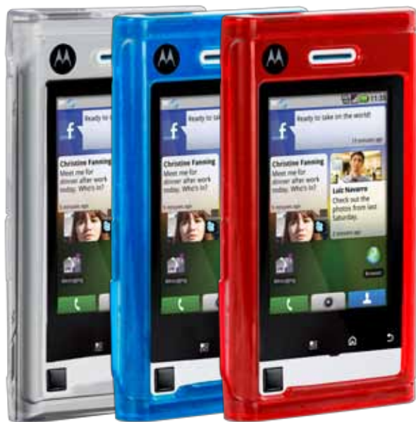
Snap On Cover Clear . . . . 63-0183-01-XE Blue . . . . 63-0185-01-XE Red . . . . 63-0184-01-XE MSRP $19.99