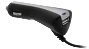
Micro USB Premium Vehicle Power Charger with USB Port 31-0991-01-XE MSRP $24.99