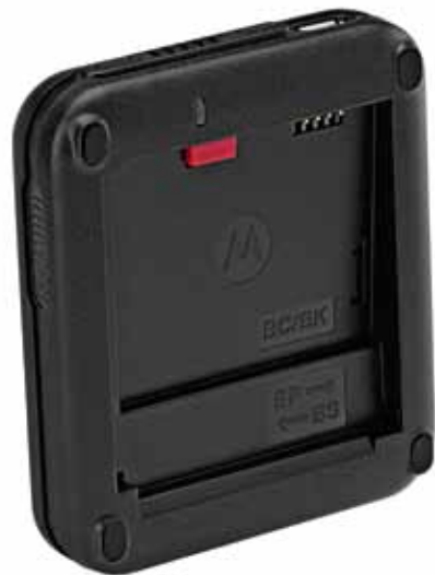
Motorola Platform Battery Charger 60-2552-01-MT MSRP $19.99