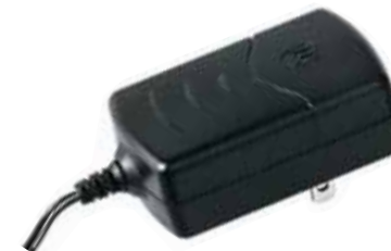
Micro USB Rapid Switch Travel Charger 33-0465-01-MT MSRP $24.99

Call Xentris Wireless today at 800.458.2820 or visit xentriswireless.com