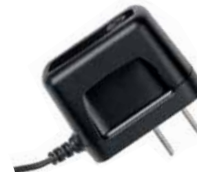
Micro USB Travel Charger 33-0399-01-XE MSRP $14.99