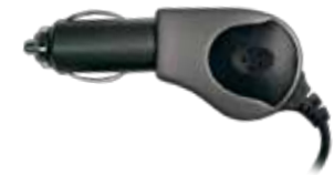
Micro USB Essential Vehicle Power Charger 31-0933-01-XE MSRP $19.99