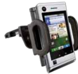
Vent / Dashboard Car Mount 60-1940-01-XE MSRP $24.99