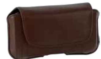
Brown Faux Leather Pouch 34-2342-01-XE MSRP $19.99

Call Xentris Wireless today at 800.458.2820 or visit xentriswireless.com