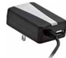
Micro USB Premium Travel Charger with USB Port 33-0448-01-XE MSRP $24.99