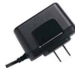
Micro USB Rapid Fixed Travel Charger 34-0464-01-MT MSRP $24.99